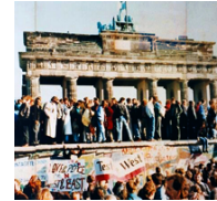
Exhibit: Twentieth Anniversary of the Fall of the Berlin Wall January - February